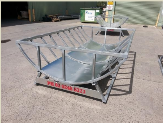
Half Skirt Sheet Base – Product Code: HCS25G

Conserve hay and maximise your feed potential at a low cost with a hay cradle. Designed to the correct height and dimensions specifically for sheep , Paton Hay Cradles are the best low cost feeding solution for your flock. We stand behind our product and we stand behind its strength and build quality.