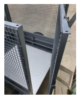
Optional Swing Gate

Overall Length: 2690mm Overall Width: 1570mm Overall Height: 1500mm Cage Height: 780mm