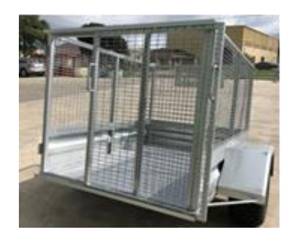
Rear Slide Gate