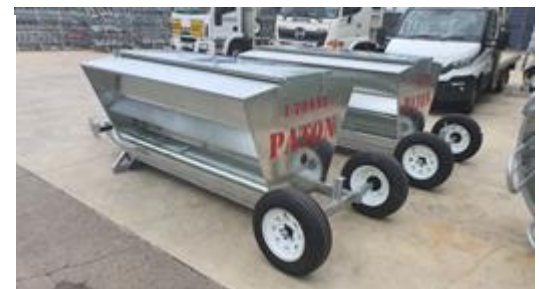
Standard axle position